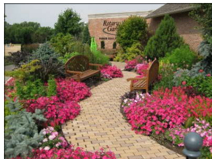
The 2009 Entrance Gardens