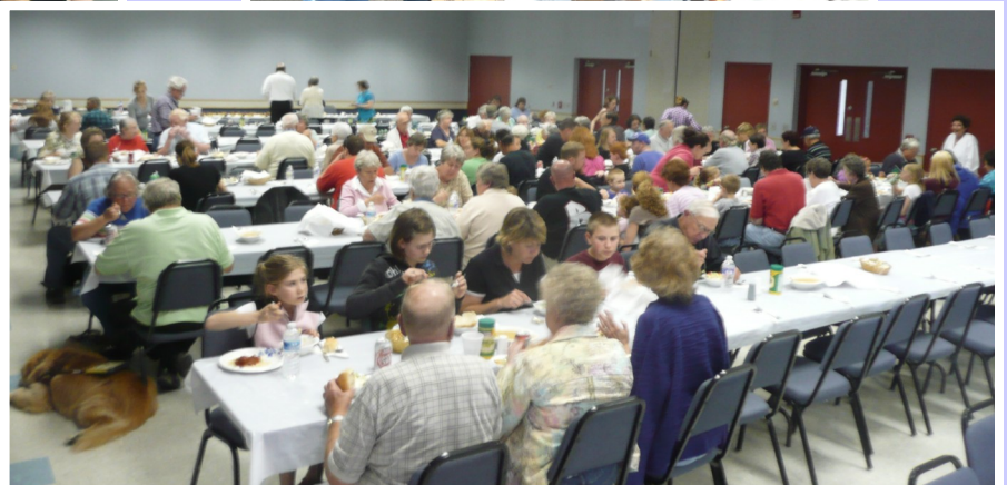
Above- The Chefs, Upper right- The Drive-Thru Crew Lower right- Happy Diners